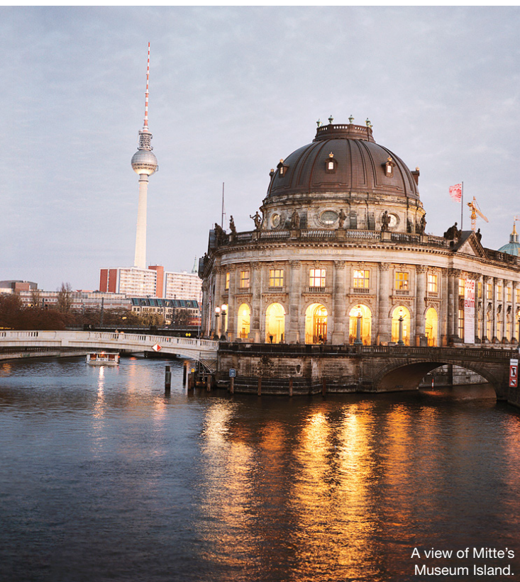
A view of Mitte's Museum Island.