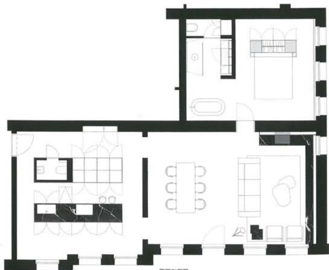
平面布置图 Apartment Plan

设计公司：Bruzkus Batek Architekten ✨ Design Studio: Bruzkus Batek Architekten